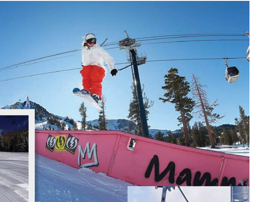
From left: Fresh grooming at the Arizona Snowbowl thanks to new snowcats; Mammoth's new terrain park; and Sun Valley's new Roundhouse Express.

Mountain High in Wrightwood, Calif. This SoCal ski haven built a new terrain park at its East Resort with 1.6 miles of continuously flowing terrain that blends big and small elements, including banks, hips, jibs and jumps, and a learn-to ride zone, which will also have a variety of banks and rollers. The west side of the resort got some touch-ups as well, such as a new stair feature in the Playground, and a “pipe” jib designed and sponsored by Skullcandy. The new pipe has built-in speakers and a removable DJ booth, so riders can hit the feature and be entertained at the same time. Skullcandy DJs will make regular appearances at the resort,